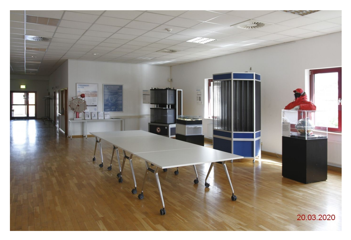
DESY Campus Zeuthen: Empty event rooms are still part of everyday life.