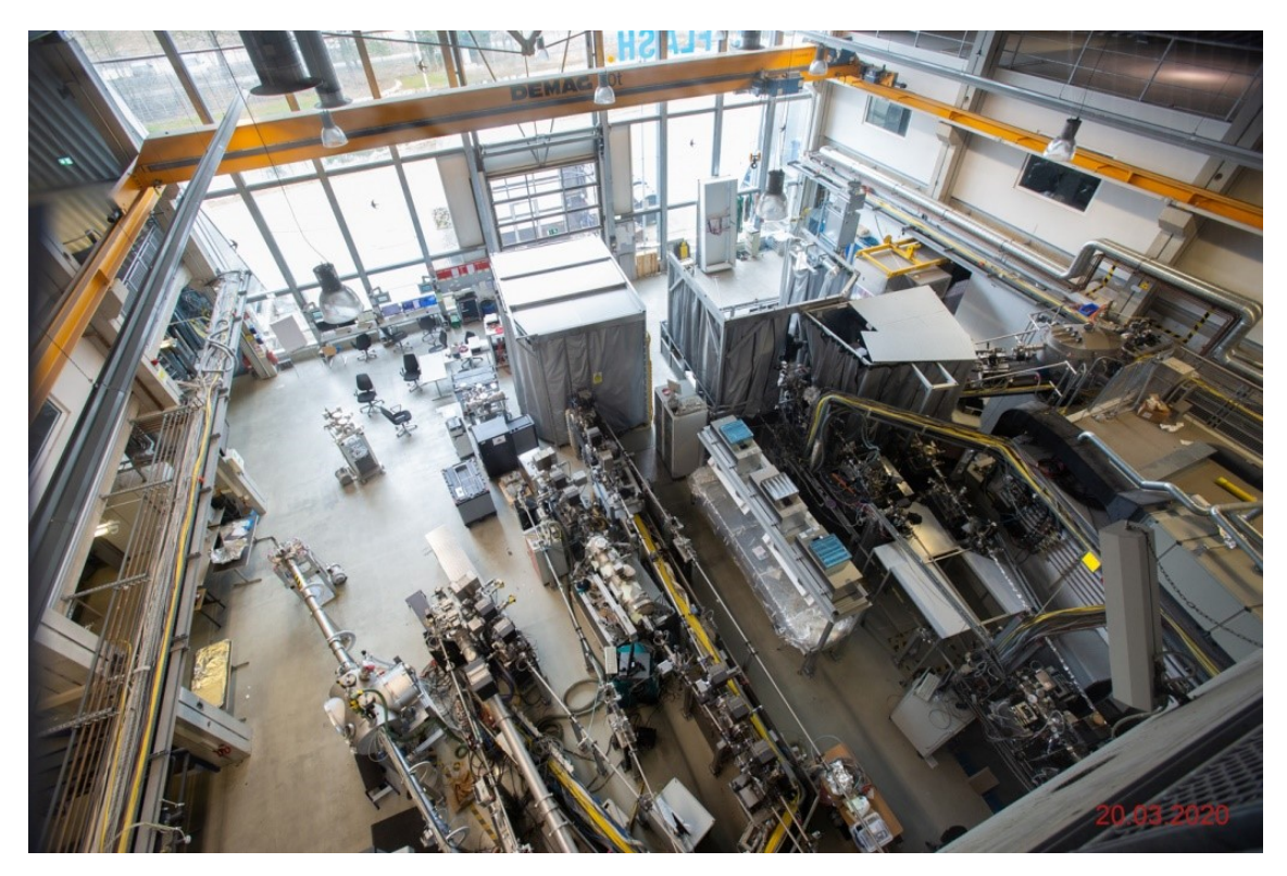
The empty FLASH experimental hall. No experiments are currently taking place.