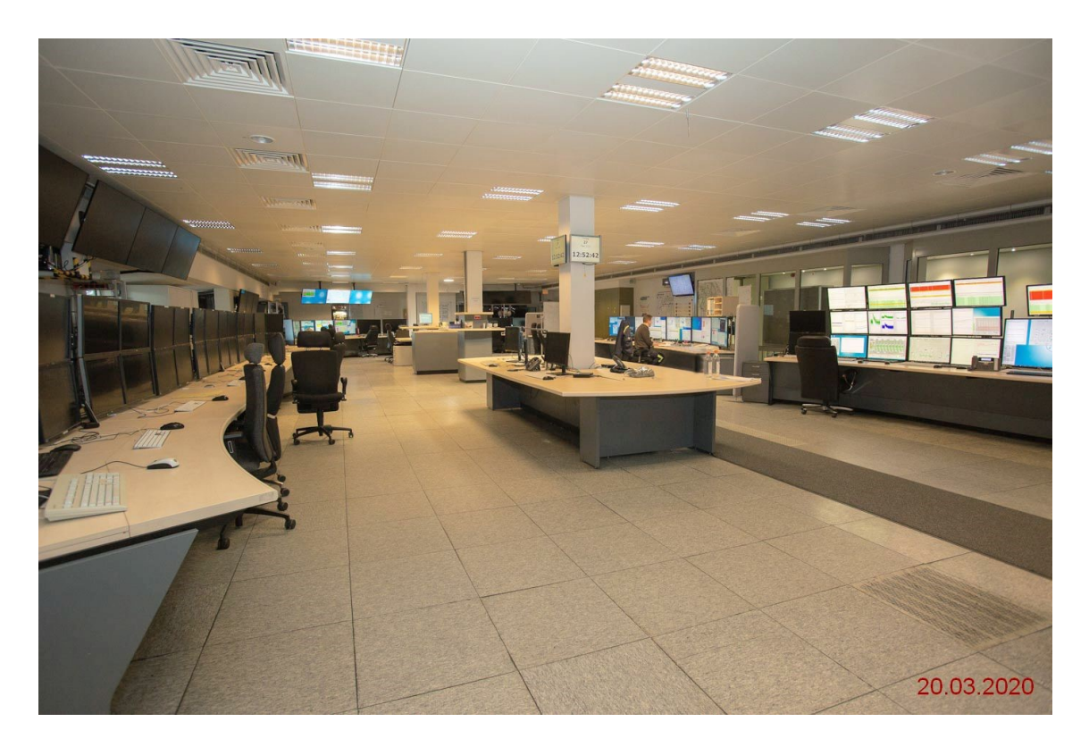
The accelerator control room is almost deserted. The accelerators are now operated in basic mode only.