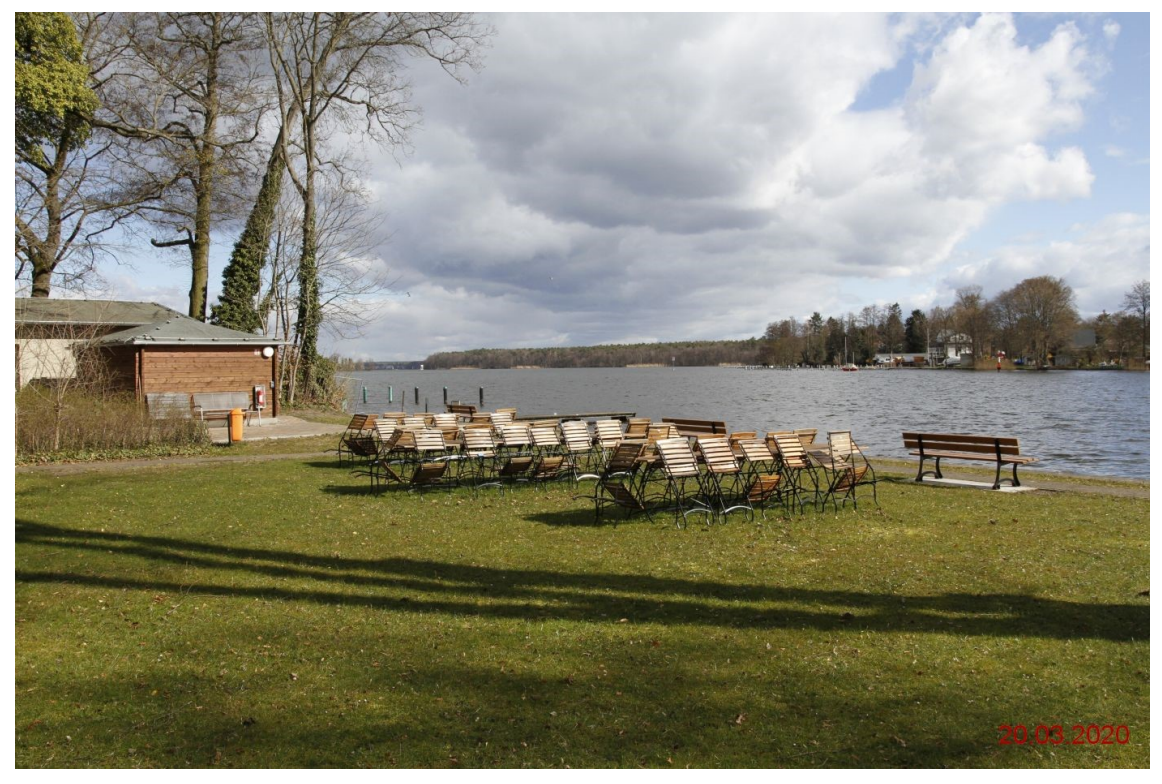
DESY Zeuthen: The otherwise much sought-after spot on the lake remains empty.