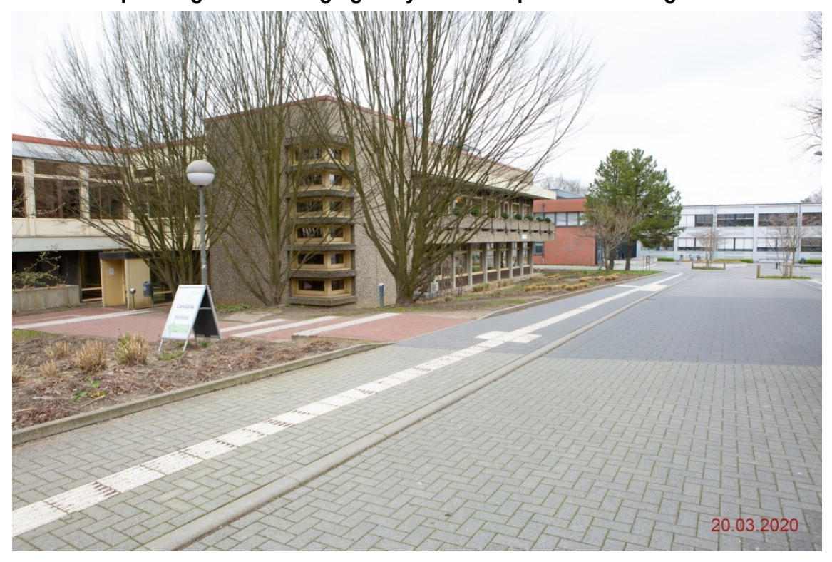
The DESY canteen on the Hamburg campus: no visitors at lunchtime.