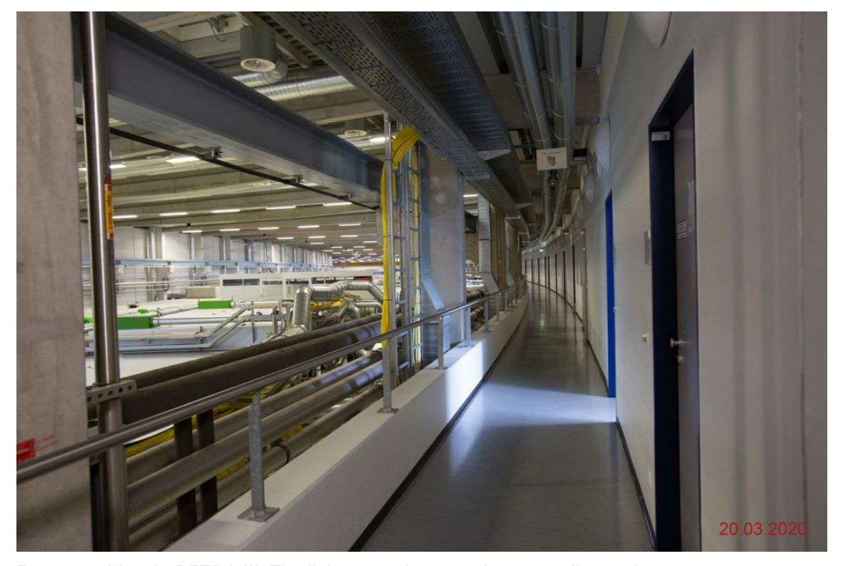
Empty corridors in PETRA III. The lightsource is currently on standby mode.