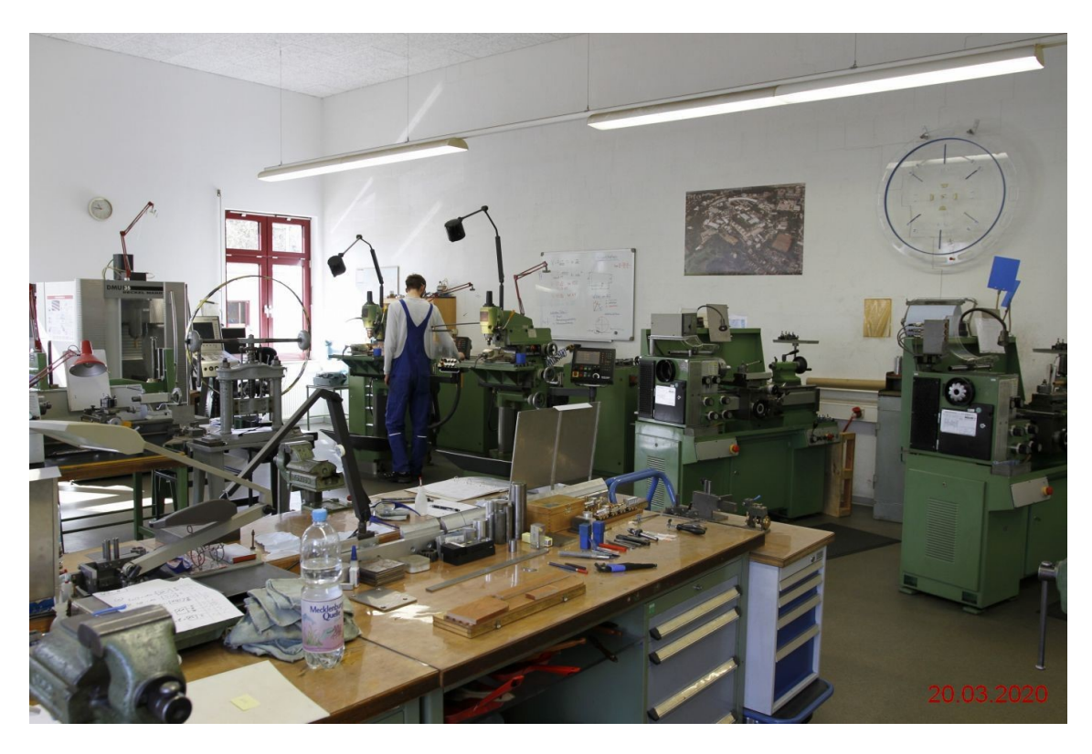
Workshop in Zeuthen: people are working in two shifts so that only half of the employees have to be on site.