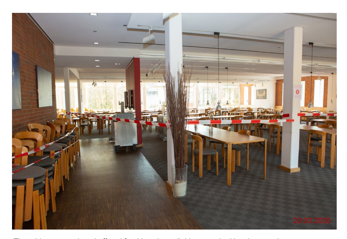
The tables are cordoned off and food is only available as packed lunches to take away.