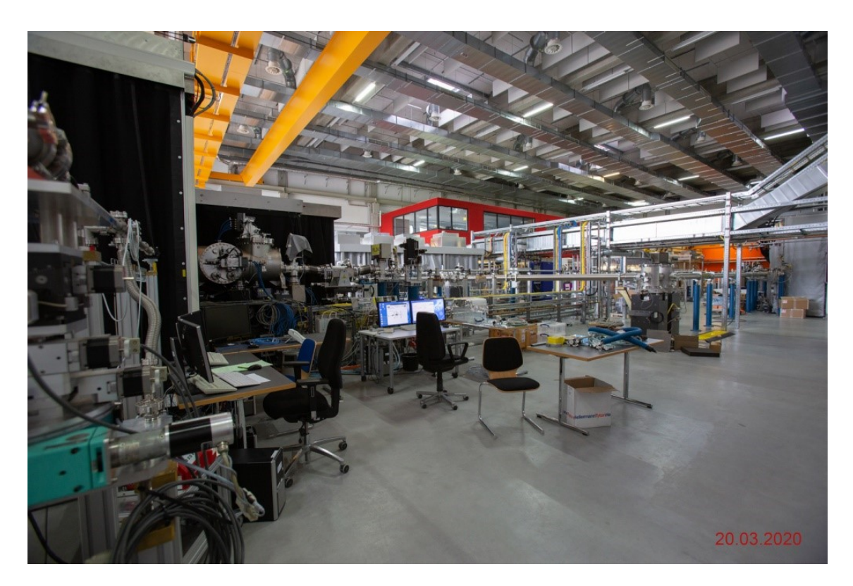
No user operation at FLASH. The free-electron laser is in sleep mode.