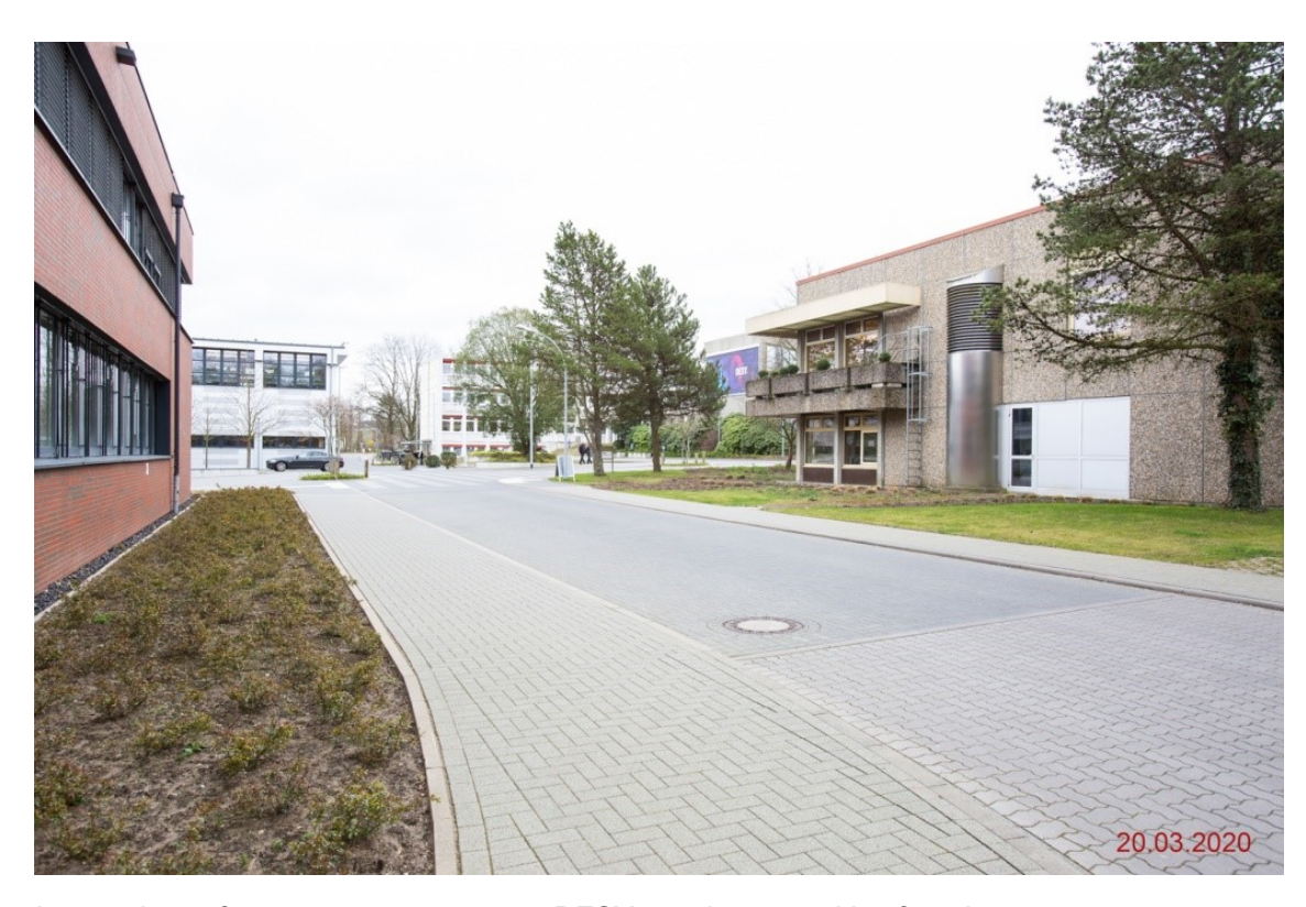
Impressions of an empty campus: most DESY people are working from home.