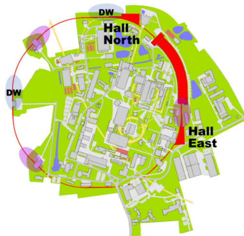
Figure 1: Layout of PETRA III. Two new halls in the North and East have been added.

lines in the Max von Laue experimental hall. The location of the new halls is shown in Fig.1. A detailed layout of the hall North of the PETRA extension is shown in Fig.2. The original plan to reuse the existing accelerator tunnel [3, 4] was not implemented since a new tunnel section is advantageous for the installation of the front end components of the beamlines. The decision to completely reconstruct the tunnel sections was one of the reasons to revise also the project schedule.