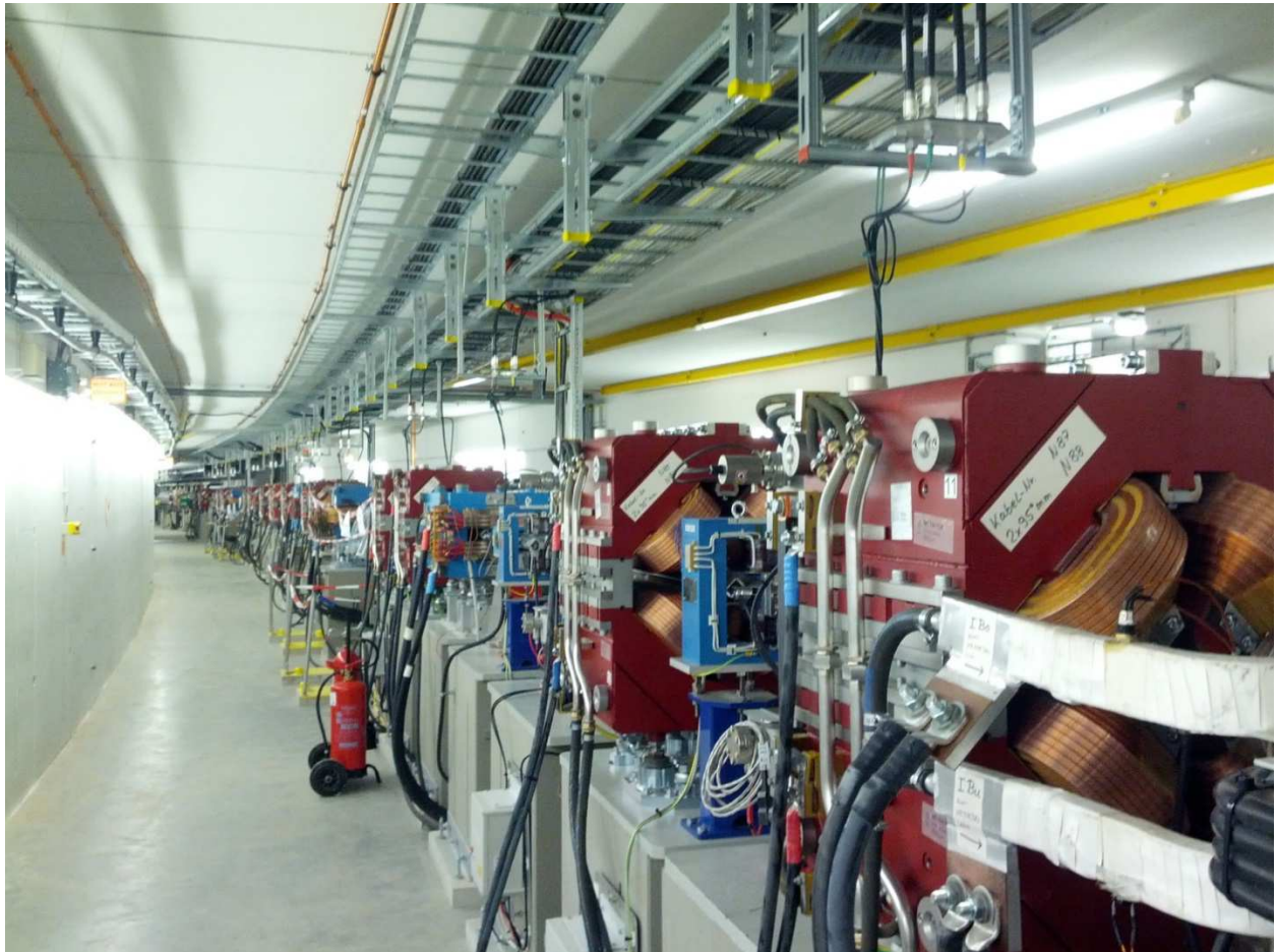
Figure 4: PETRA III extension North. The new DBA like lattice of the extension section North is shown in the photo from April 2015.

The beam quality in the 960 bunch mode has not yet achieved the design values due to ion effects which are degrading the vertical emittance.