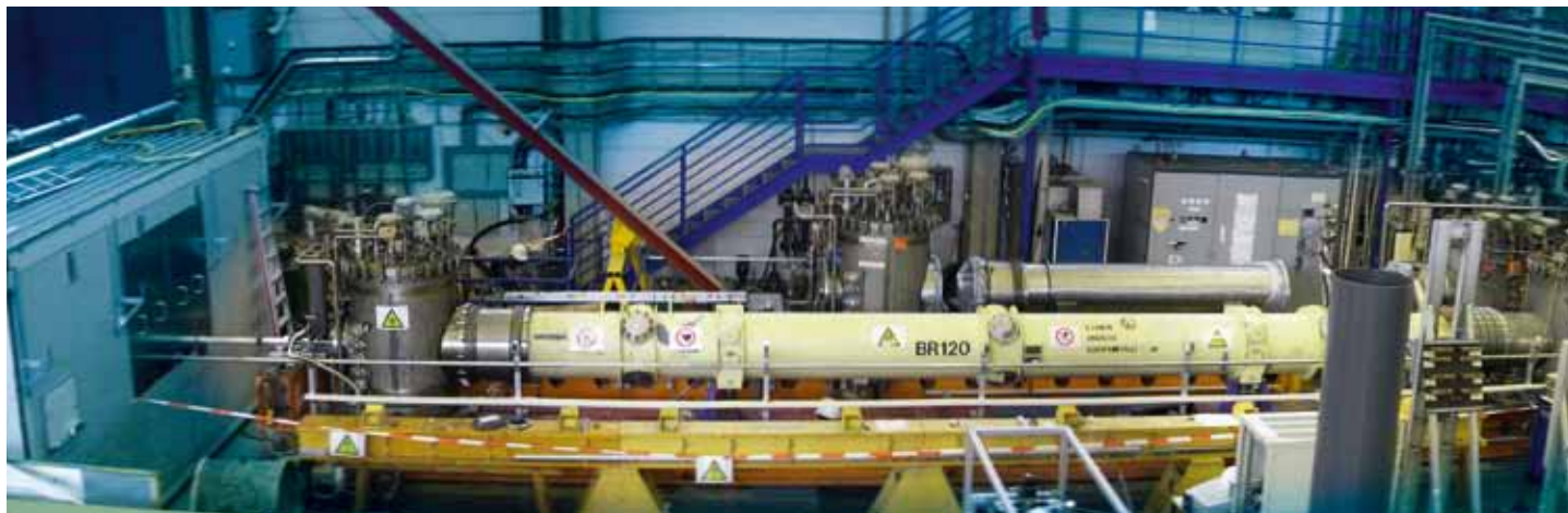
ALPS: here still the small version, the huge one is yet to come

Preparations for ALPS II are in full swing