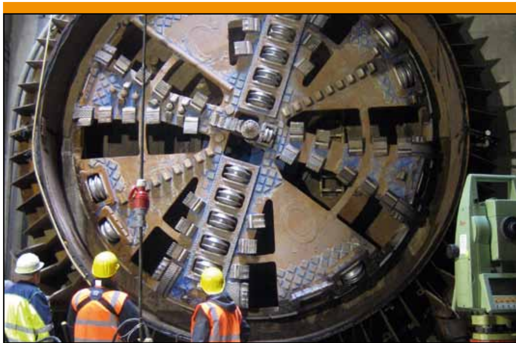
After more than seven months of underground work, TULA's cutterhead showed again.