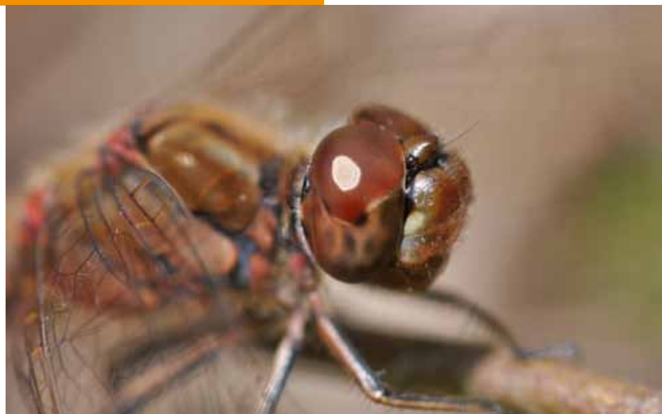
Here's looking at you, kid. Compound eyes of an vagrant darter ( Amax imperator )