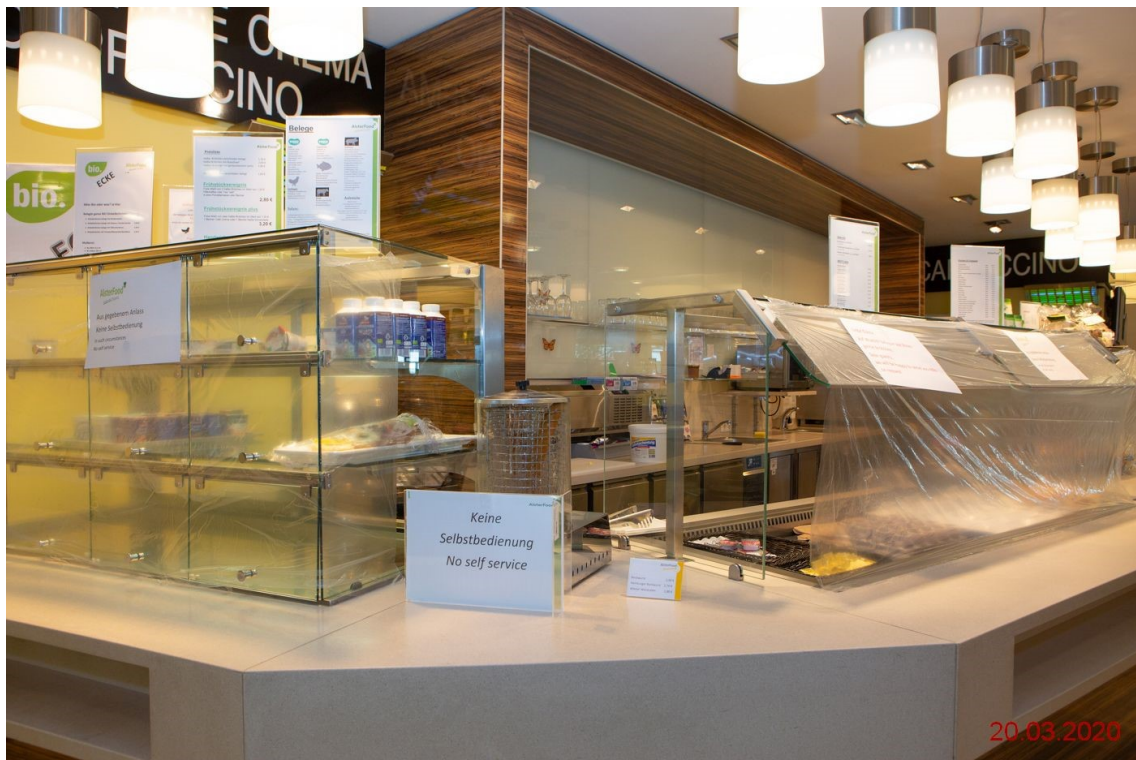
The cafeteria in Hamburg: packaged sandwiches and snacks only.