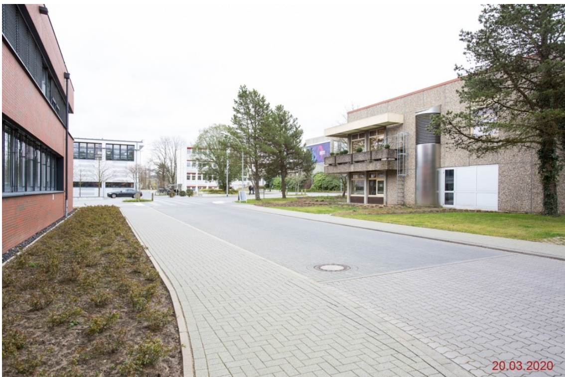
Impressions of an empty campus: most DESY people are working from home.