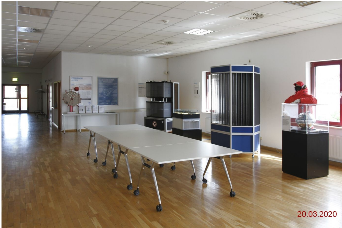
DESY Campus Zeuthen: Empty event rooms are still part of everyday life.