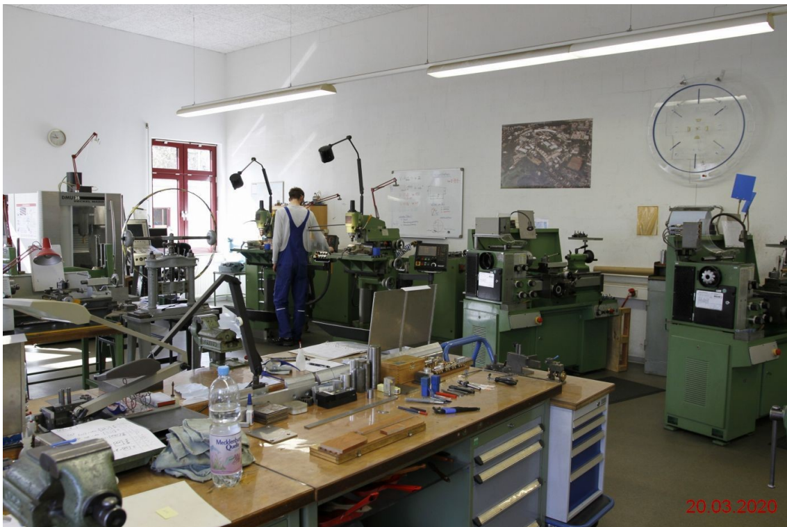
Workshop in Zeuthen: people are working in two shifts so that only half of the employees have to be on site.