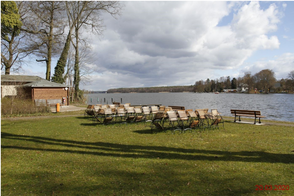
DESY Zeuthen: The otherwise much sought-after spot on the lake remains empty.