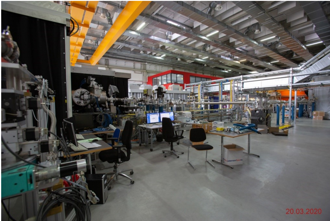
No user operation at FLASH. The free-electron laser is in sleep mode.