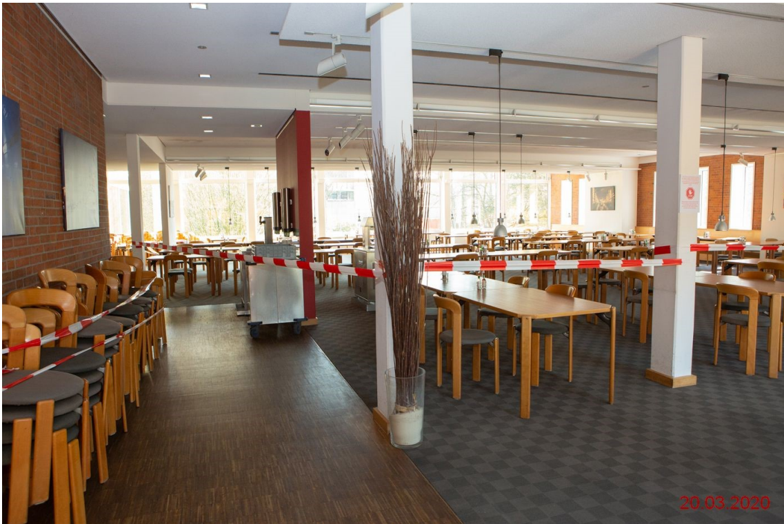
The tables are cordoned off and food is only available as packed lunches to take away.