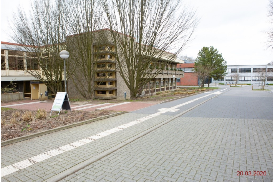
The DESY canteen on the Hamburg campus: no visitors at lunchtime.